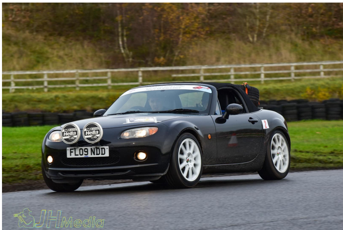
Photo by JH Media – returning as official photographer again in 2023!